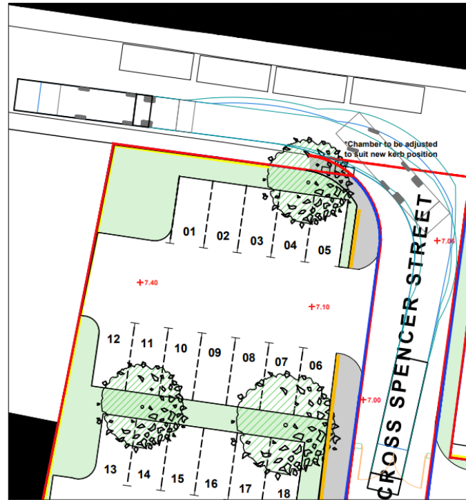
EXIT SWEEP PATH ANALYSIS